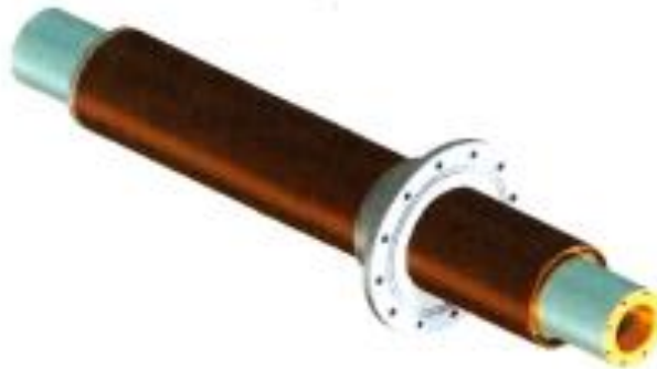
INDICATIVE IMAGE OF TERMINAL BUSHINGS

Introduction: Indented Terminal Bushings are used for current transfer between the generator stator & bus ducts in large size Turbo-Generators of 500 MW & above rating and as such these bushings are subjected to very high current during normal as well as fault conditions. The bushings are subjected to stringent tests relating to dielectric strength, leak tightness, bending, mechanical strength, sudden short circuit test, angular deviation, impulse voltage withstand test etc.