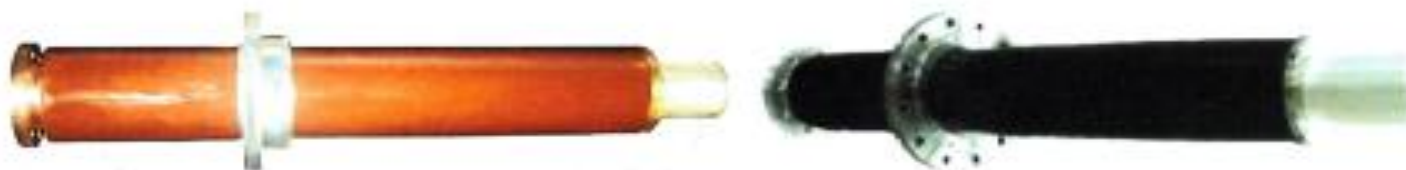
INDICATIVE IMAGES OF TERMINAL BUSHINGS

Introduction: Indented Terminal Bushings are used for current transfer between the generator stator & bus ducts in large size Turbo-Generators of 800MW rating and as such these bushings are subjected to very high current during normal as well as fault conditions. The bushings are subjected to stringent tests relating to dielectric strength, leak tightness, bending, mechanical strength, impulse voltage withstand test etc.