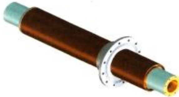
INDICATIVE IMAGE OF TERMINAL BUSHINGS

Introduction: Indented Terminal Bushings are used for current transfer between the generator stator & bus ducts in large size Turbo-Generators of 500 MW & above rating and as such these bushings are subjected to very high current during normal as well as fault conditions. The bushings are subjected to stringent tests relating to dielectric strength, leak tightness, bending, mechanical strength, sudden short circuit test, angular deviation, impulse voltage withstand test etc.