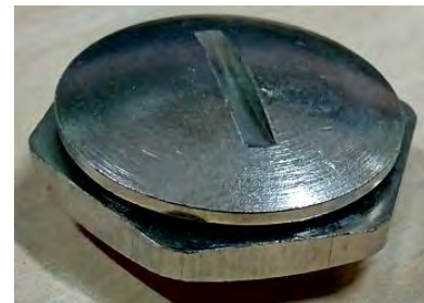
Figure 4 : Cable Gland Blank for reference

Bidder to note that there are various plastic glands used in small connection/Junction boxes, PLS interface boxes and ship sensors wherein the cable needs to be simply entered