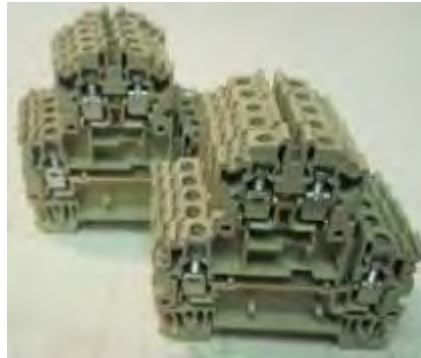
Figure 6 : Terminal Block for reference

The screw terminations to be connected to terminal blocks provided inside the panels. The sample terminal block is shown below,