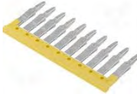
Figure 7 : Shorting Links for reference