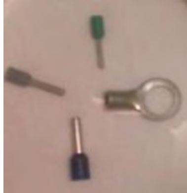
Figure 5 : Types of lugs for reference

Phone : +91-80-25146129 Fax : +91-80-28520135 E mail : srajesh@bheledn.co.in Mobile : +91-98456 34534