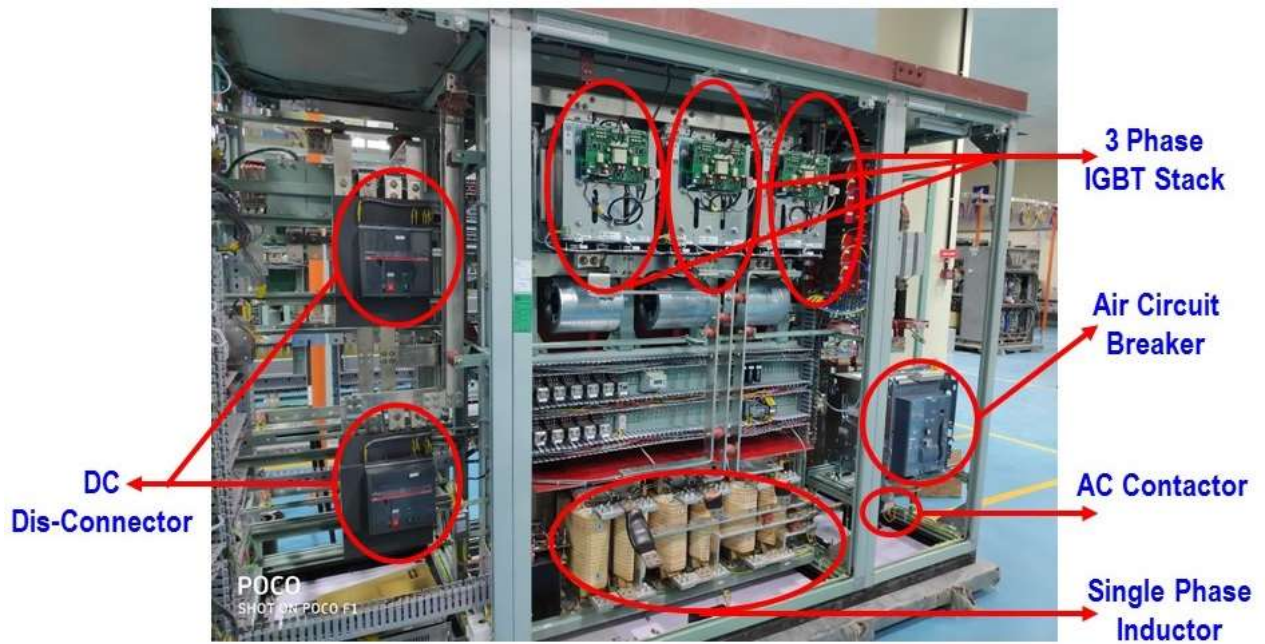
Front Internal View Of A 1.25MW PCU

Tender Reference: DE/PCU/AMC/2019/02 Date : 09/08/2019