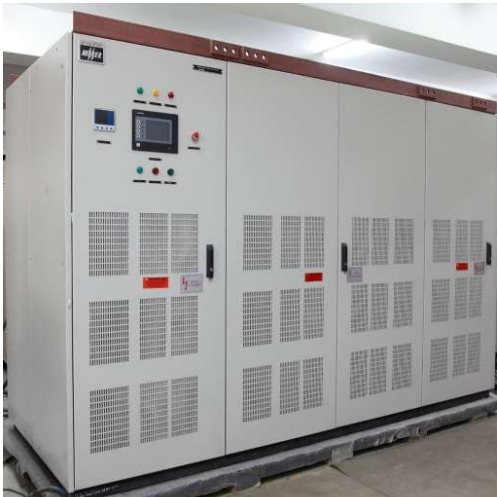
Front External View Of A 1.25MW PCU

BHEL – PV1250 comprises of IGBT based three phase inverter for converting DC voltage of solar PV array to 3-phase AC and exports power to grid. High speed DSP based control software has been developed for grid synchronization, power export, maximum power tracking and reactive power control. The unit has been tested for grid synchronization, reactive power control and active power export and MPPT. Touch panel based HMI aids operator to visualise the critical operating parameters. Remote monitoring feature through LAN/Internet is included to view the performance data remotely.