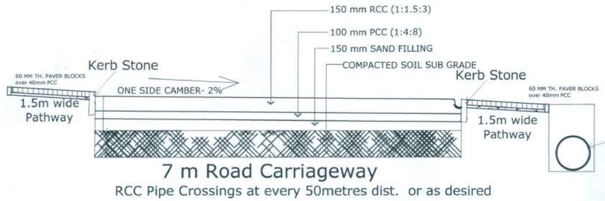
Cross Sectional Details Plant Area Connecting Road (Package A)