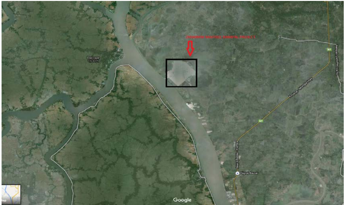
LOCATION MAP:2X660MW MAITREE RAMPAL PROJECT