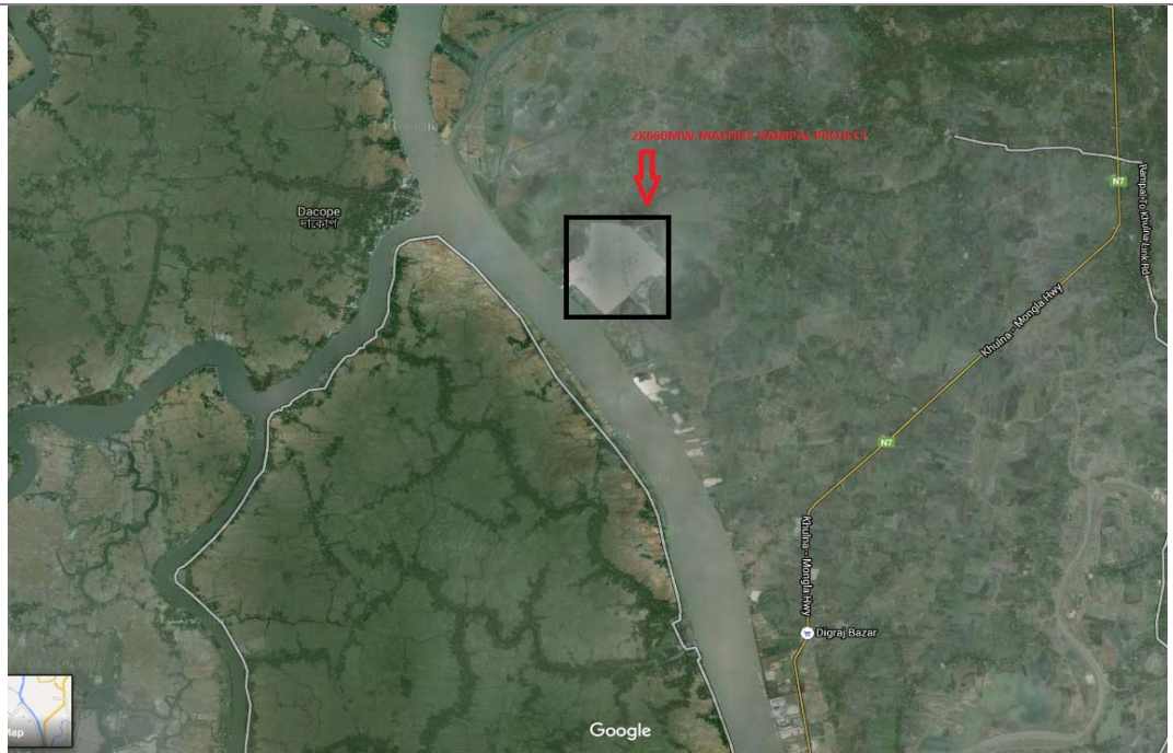
LOCATION MAP:2X660MW MAITREE RAMPAL PROJECT