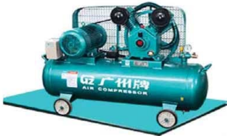
Air compressor for site painting

e) Scaffolding including tower and walkway