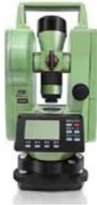
Theodolite used in measuring

k) Soft Nylon rings + Chain blocks + Pull-Lifts + U shaped shackles.