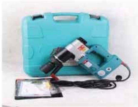
Electric Torque wrench used in high strength bolts