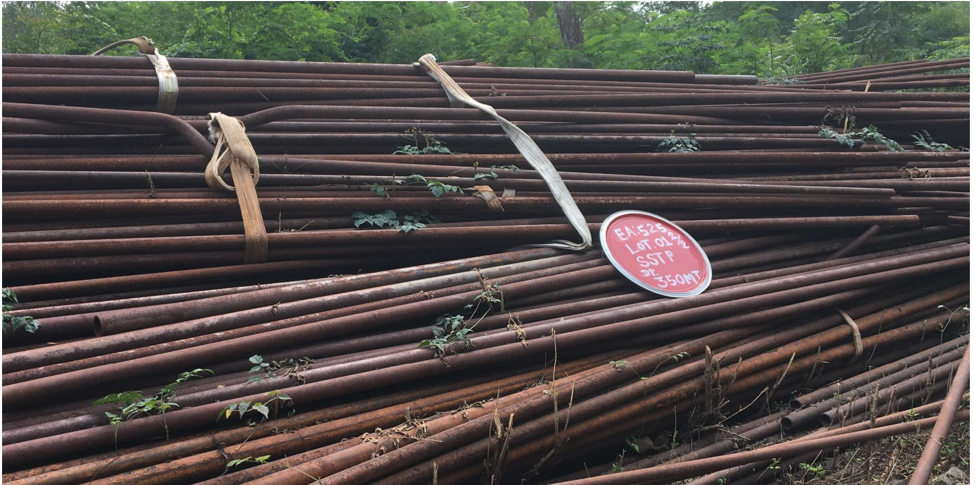
LOT-1 : Near SSTP Gate