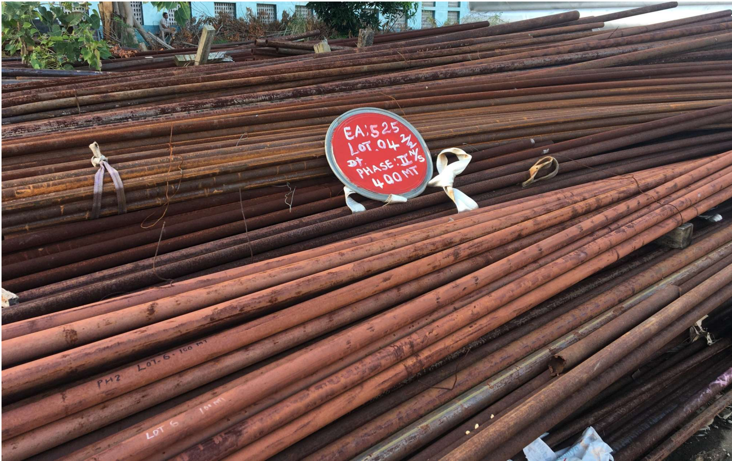
LOT-4 : Unit – II Store