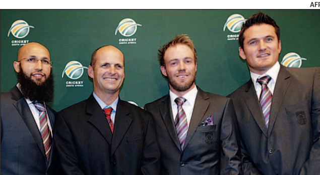
Gary Kirsten (2-L) pose with Hashim Amla (L), AB De Villiers (2-R) and Graeme Smith (R) during a press conference in Johannesburg on Monday