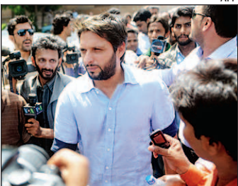
Shahid Afridi is surrounded by supporters as he leaves after filing a petition at Sindh High Court in Karachi on Tuesday