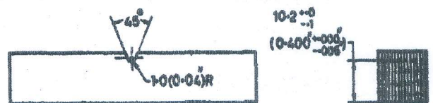
Figure - 1