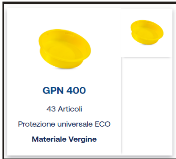
Picture of Plastic Plug

Application: These plugs are used for protecting pipes during not working period.