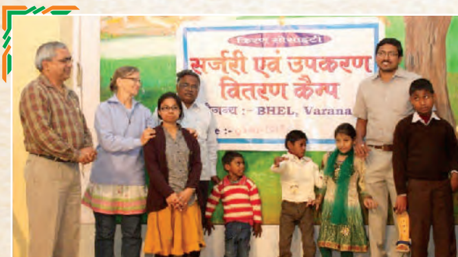
Free Surgery & Equipment Distribution Camp

Hemophilia Society, Varanasi which has been established to cater to the need of persons afflicted with Hemophilia, a life-long disorder with repeated episodes of bleeding. The centre renders emergency care needs, comprehensive treatment, psycho-social support, carrier detection, awareness programmes etc. to the extremely poor sections of the society. They are running a 17-bedded care centre in a double-storied building where persons afflicted with Hemophilia come to obtain medical and physiotherapy treatment. More than 600 persons are registered with the society for treatment.