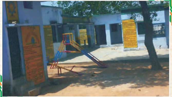
Playground equipments for School children

Play ground equipments (like Slide, See-saw, Rainbow ladder) & sports facilities (like Carom boards, Cricket