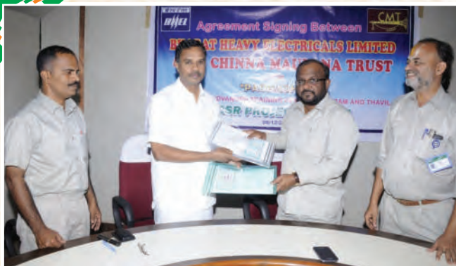
Signing of Agreement with Dr. Chinna Maulana Memorial Trust

An agreement was signed between Dr Chinna Maulana Memorial Trust and BHEL with milestone activities and payment schedules. Selection of Beneficiaries, selection of trainers, identifying manufacturers of Instruments