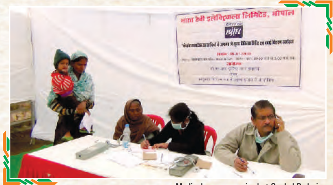
Medical camp organized at Sankal Padariya

BHEL, Bhopal under its Corporate Social Responsibility Program organized 03 medical camps during financial year 2014-15. The camps organized on 19.09.2014, 31.10.2014 and 09.01.2014 in the nearby villages of Jamunia Kalan, Amjhara and Sankal Padariya, respectively, were overwhelmingly successful.