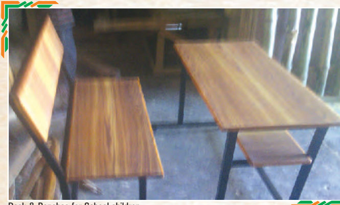
Desk & Benches for School children

A total of 150 students from socially and economically weaker sections and rural backgrounds are studying in these schools.