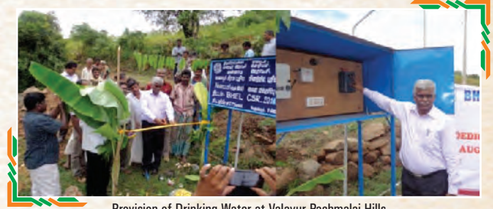
Provision of Drinking Water at Valayur Pachmalai Hills

An agreement was signed between BHEL and the Block development Officer (BDO) of Thurairur Taluk with