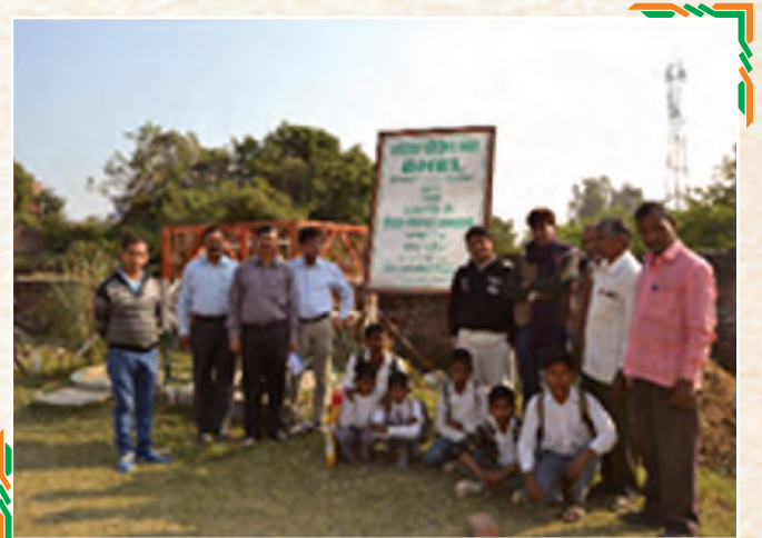
Interaction with school children during implementation