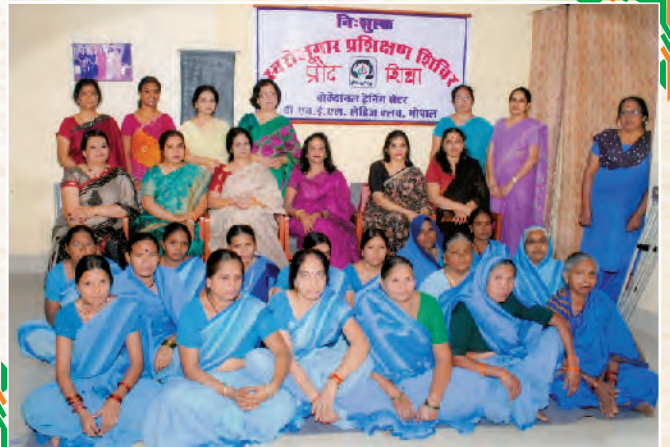
Skill Development Program on Adult Education conducted by BHEL Ladies Club

BHEL Ladies Club conducted Skill Development Programs of “Dholak Learning, Beautician Course, Rangoli, Madana, Adult Education and Spoken English”. Various beneficiaries for the program were female participants belonging to weaker sections of the society. In all, there were 140 participants in the program.