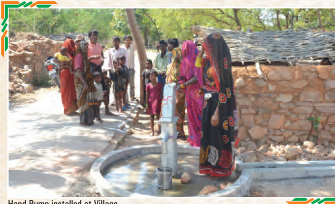
Hand Pump installed at Village

The water hand pumps were formally handed over to the community. During the programme, the CSR committee members interacted with the rural public