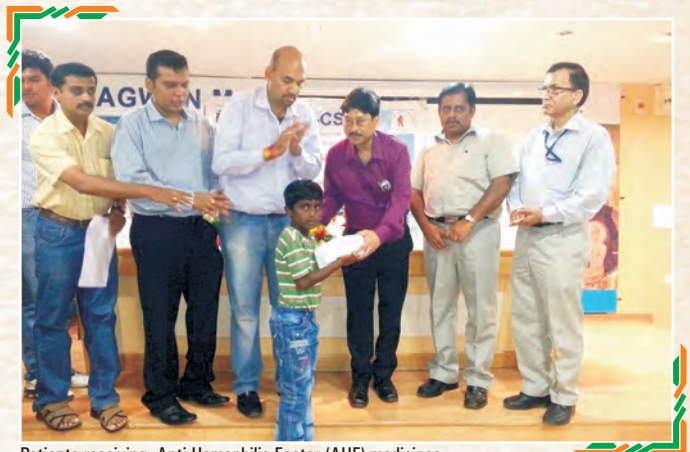
Patients receiving Anti Hemophilic Factor (AHF) medicines

Hemophilia Society and Physiotherapy equipments to Bangalore Hemophilia Society.