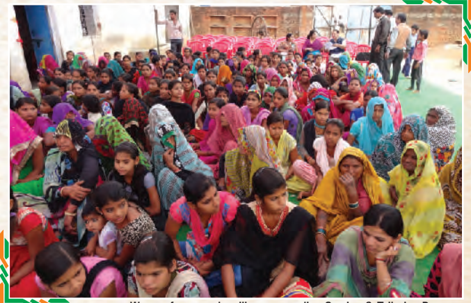
Women from nearby villages attending Cutting & Tailoring Program

providing them with financial assistance and books etc. The organization is also associated with activities like, organizing medical camps, providing drinking water facilities for the socially and economically backward communities, helping in environment protection by organizing environment awareness programmes, tree plantation, etc.