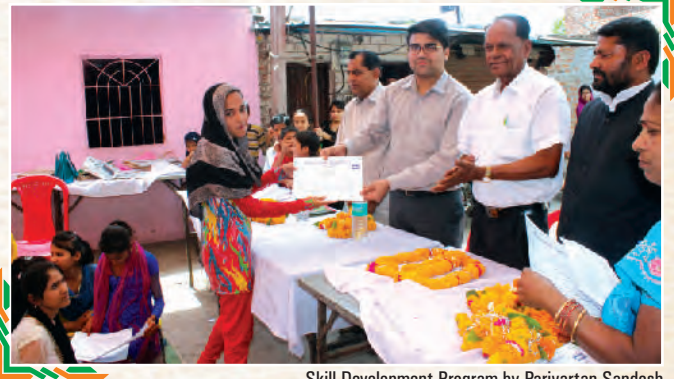
Skill Development Program by Parivartan Sandesh

Parivartan Sandesh conducted Skill Development Program on “Jute Handicraft”. Beneficiaries of the program were female slum dwellers of the gas tragedy-affected slums of Bhopal. Total number of participants in the program were 100.