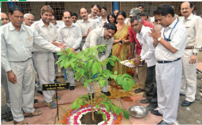
Plantation done in Jawaharlal Nehru School