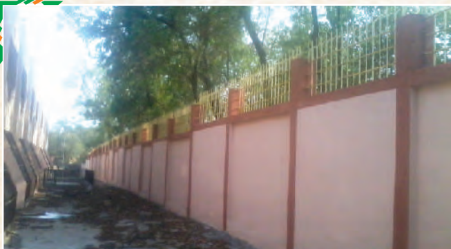
New Boundary Wall in Triveni Girls Hostel

BHEL, Bhopal under its CSR Program for FY 2014-15 completed various renovation works in the Triveni Girls Hostel. The hostel is meant for working women and female students belonging to economically weaker sections of the society.