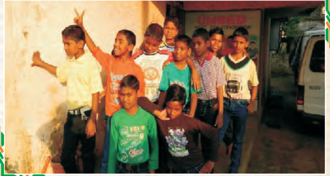
Children of the AARAMBH Umeed Shelter Home, Bhopal

Bhopal for meeting their requirement of food and nutrition.