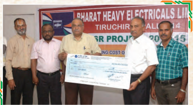
Cheque distribution ceremony for providing feeding to rare species in Arinagar