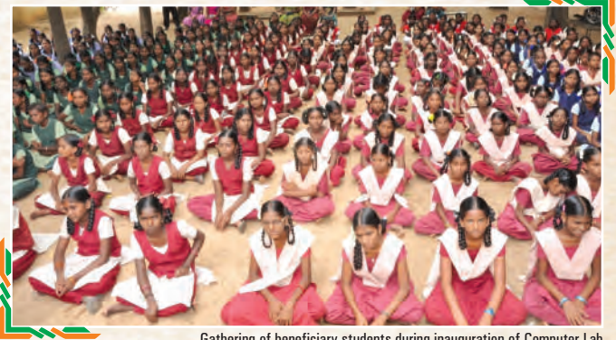
Gathering of beneficiary students during inauguration of Computer Lab at Government Higher Secondary School, Kodaikal Village.

The unit constructed water sump to store water for Girls Hr. Sec. School at Arakkonam in Vellore district. The area where the school is located is a drought prone area and the available water need to be stored for better water management. The school authority did not have the facility to store water and was finding it difficult to make water available continuously for drinking and sanitary purposes. With a helping hand from BHEL-Ranipet, the school management is now able to store water in the sump and use it efficiently.