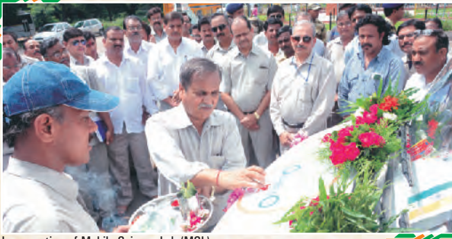
Inauguration of Mobile Science Lab (MSL)

A Bipartite Agreement has been executed between BHEL and Agastya International Foundation, Bangalore for implementing the CSR Project - Financial Support for “ Mobile Science Lab (MSL) ” for Schools of Jhansi & nearby places under CSR project initiatives of BHEL.