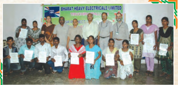
Employability through TREC STEP

An agreement was signed between CII Foundation and BHEL for carrying out this project. The CII Foundation in turn entered into an agreement with the Prison Authorities. BHEL provided the cost of training infrastructure and training staff. CII Foundation partnered with TREAT as the execution partner to provide the training. The WRI agreed to test the trainees and issue certificates. First batch training has been completed. It is a two year project.