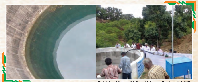
Drinking Water Well at Valayur Pachmalai Hills

project milestone activities and payment schedule. The BDO was the nodal agency for this project. The Well was dug out and a pump set installed for pumping water to the adopted villages. The total Cost of the Project is Rs. 12.69 Lakh.