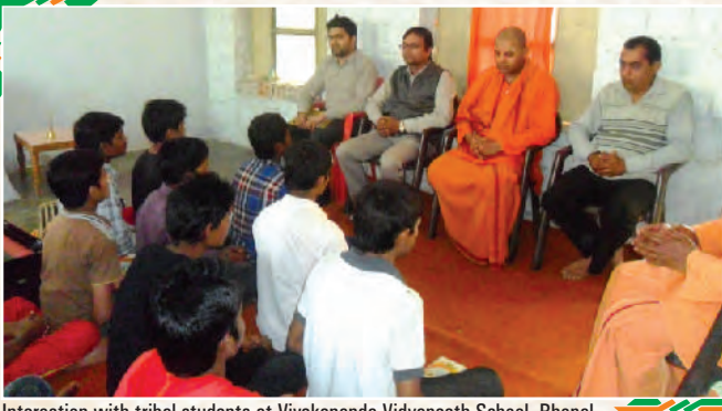
Interaction with tribal students at Vivekananda Vidyapeeth School, Bhopal

Under its CSR Program for FY 2014-15, BHEL, Bhopal extended support to Vivekananda Vidyapeeth, Awadhपुरी, Bhopal for providing education and related facilities to 20 adopted tribal children including food and lodging. BHEL is supporting the school since FY 2012-13. The school is run by Ramakrishna Mission Ashram, Bhopal (A branch of the Ramakrishna Math and Ramakrishna Mission, Belur Math).