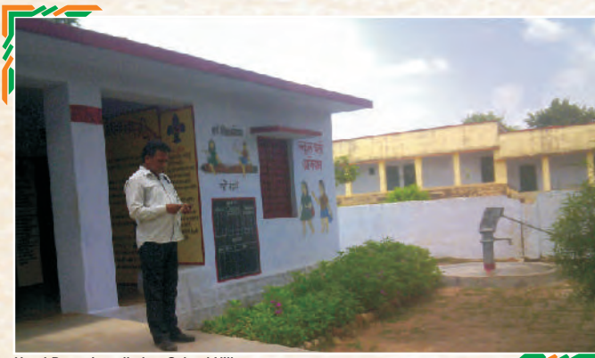
Hand Pump installed at School Village

A total of 340 rural students from economically backward communities studying in these Schools and also the under-privileged village people are the beneficiaries of this project.