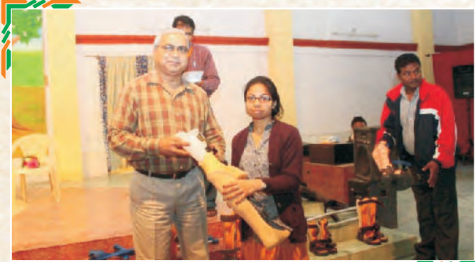
Distribution of Artificial Limbs to Persons with Disabilities (PwD)

Support to differently-abled children through NGO 'Kiran': BHEL-HERP, Varanasi supported 'Kiran', an NGO located at Village: Madhopur, PO: Kuruhuan, Varanasi, who are engaged in the service of Differently-abled/Physically Challenged children, numbering 10-15. The children are affected by post-polio paralysis,