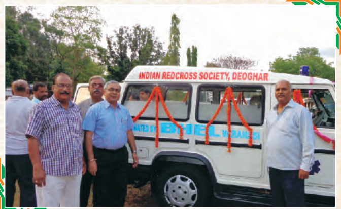
Ambulance Van provided to Indian Red Cross Society, Deoghar

Financial support has been extended for purchasing