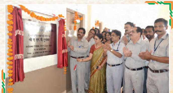
Inauguration of new classrooms by ED, BHEL, Bhopal

BHEL, Bhopal under its Corporate Social Responsibility Program constructed 04 nos of new classrooms at Jawaharlal Nehru Higher Secondary School (Primary School) run by BHEL Shiksha Mandal. The school is located in the Govindpura neighbourhood of BHEL, Bhopal Township.