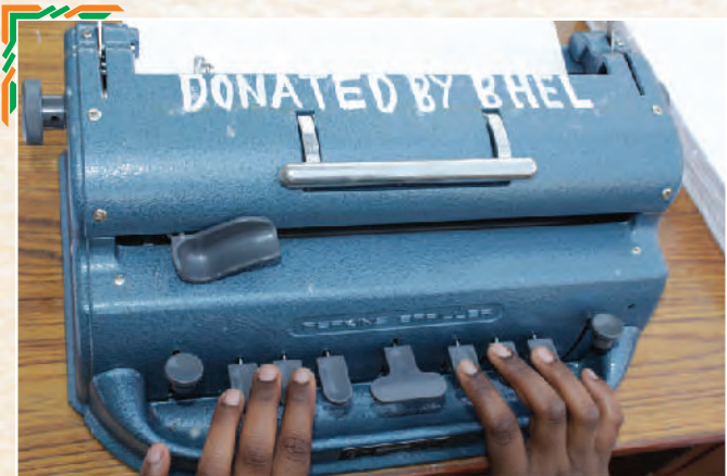
Appliances given to Persons with Disabilities (PwD) for Education

To cater to the need for rendering necessary therapeutical facilities to the children of the institute for better rehabilitation and sensory development, equipment for Gymnasium such as, Motorized Treadmill, Trampoline, Gym Ball, Exercise Cycle, Basket/Volley/Soft Balls, Rubber/Wooden Dumbbell etc. has been provided by HERP Unit at a total project cost of Rs.5.65 Lakh.