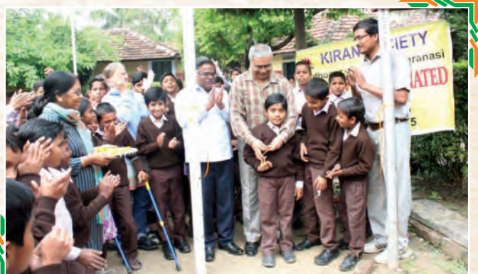
Differently-abled children of Kiran Society

A CSR project of HERP, Varanasi for providing sanitation facility in the following State Government run schools in and around the vicinity of the Unit is under execution.