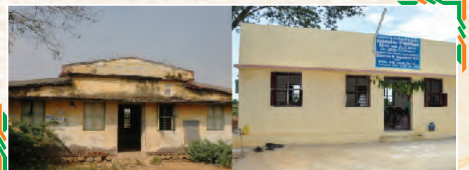
Before & After - Renovation of Krishnasamuthiram

Four halls constructed earlier by the State Government were condemned and deserted by the people in the past. The local authorities and the people requested BHEL to renovate them so that they can use them for community functions, social gatherings, conducting classes for children etc. BHEL took up the task and renovated the four Halls and handed over the same to the local authorities.