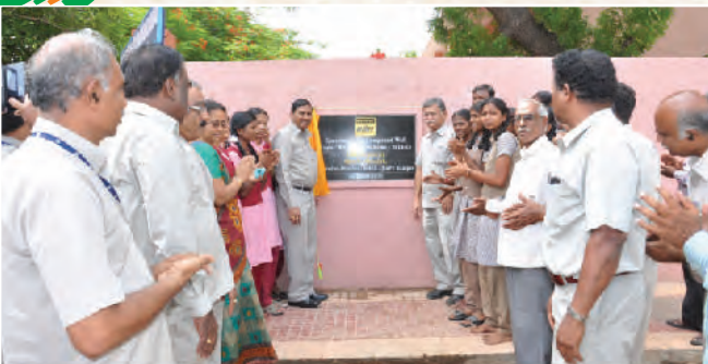
Executive Director inaugurating compound wall at Government Girls Higher Secondary School, Walajha

approx. 2500 girl students from under-privileged sections of the society study. The compound wall was in a damaged/dilapidated condition making the girl