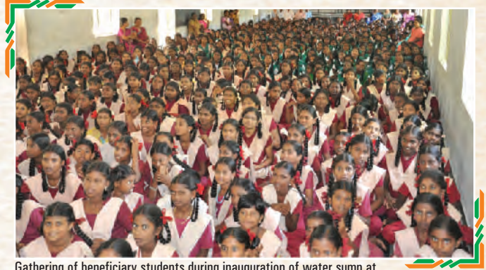
Gathering of beneficiary students during inauguration of water sump at Government Girls Higher Secondary School, Arakkonam.

In this regard, BHEL constructed a Computer Lab for