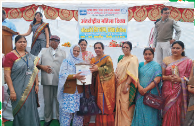
Health & Education Awareness Program at BHEL-Bhopal

On the occasion of International Women's Day on 08.03.2015, Forum for Women in Public Sector (WIPS) of BHEL conducted a program under Corporate Social Responsibility on the theme "Health, Sanitation and Education for Women". The function was organized at the BHEL adopted village of Kanha Saiyaa.