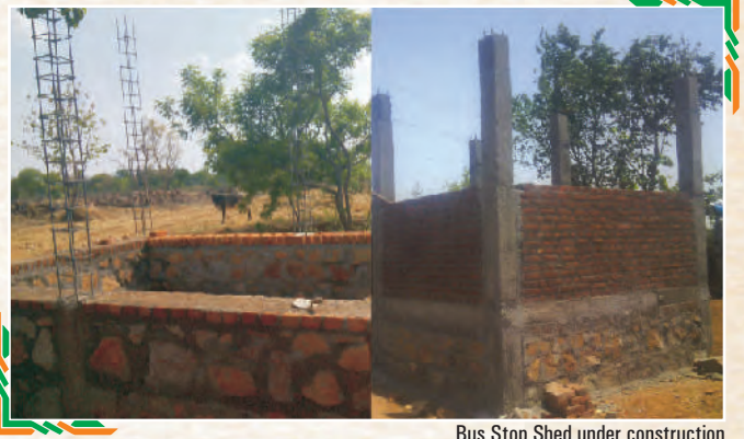
Bus Stop Shed under construction

Shri M. Khasgiwala, ED, BHEL-Jhansi inaugurated the “Bus Stop / Passengers waiting room” and handed it