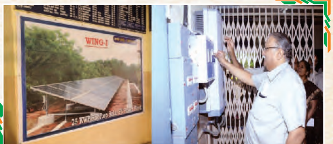
Inauguration of Solar Power Plant