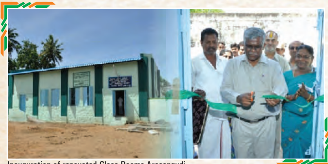
Inauguration of renovated Class Rooms Arasangudi