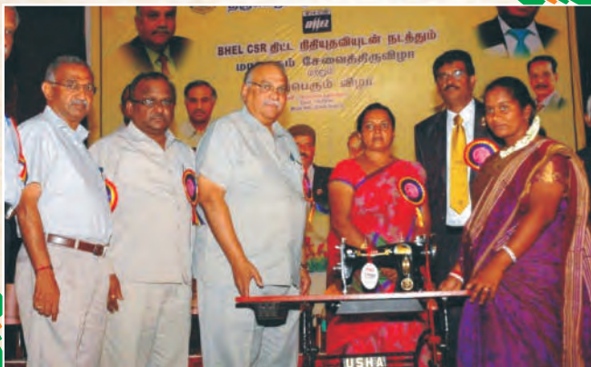
Distribution of Sewing Machines & Agricultural Tools

BHEL signed an agreement with the Lions club of Trichy. Procurement of sewing machines, agricultural tools and selection of beneficiaries was done by the Lions club. A grand function was held and 174 of persons were given sewing machines and 150 farming labourers were given agricultural tools.