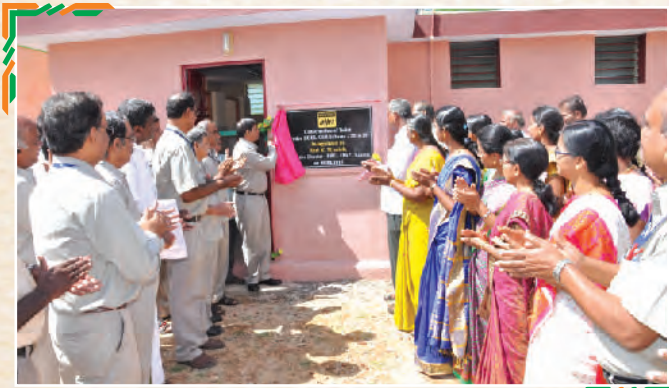
Executive Director inaugurating newly constructed separate toilets for girls and boys at Government Higher Secondary School, Rendadi Village.

In line with Prime Minister's ambitious 'Swachh Bharat Abhiyan', BHEL-Ranipet has undertaken several projects to construct toilets in the government schools of nearby areas. The Unit had constructed separate toilets for boys and girls at Govt. Higher Secondary Schools located at Rendadi and Guruvarajapet villages of Vellore District (Tamil Nadu) under its CSR project initiatives for the year 2014-15. Around 2300 students belonging to underprivileged sections of the society are studying in these schools. Previously, both the schools did not have any toilet facility. The construction of toilets by BHEL has come as a big boon for the students and staff of both the schools, especially for the girl students. This also helped to improve the sanitation and personal hygiene of the school children and staff. Besides, now both the school campuses look clean and tidy thus raising the students' morale as well as their comfort levels.