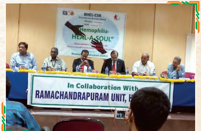
Anti Hemophilic Factor (AHF) medicines distribution Program