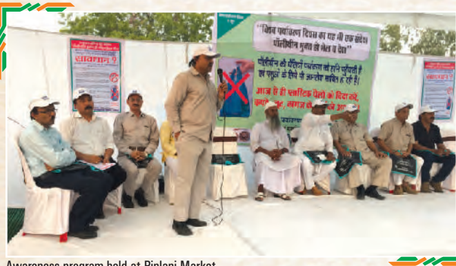
Awareness program held at Piplani Market

On the occasion of World Environment Day on 05.06.2015, 02 programs on the theme “Awareness Program on the ill-effects of Polythene” were organized. The programs were organized on 04.06.2015 and 06.06.2015 in the Piplani and Barkheda markets of BHEL-Bhopal.