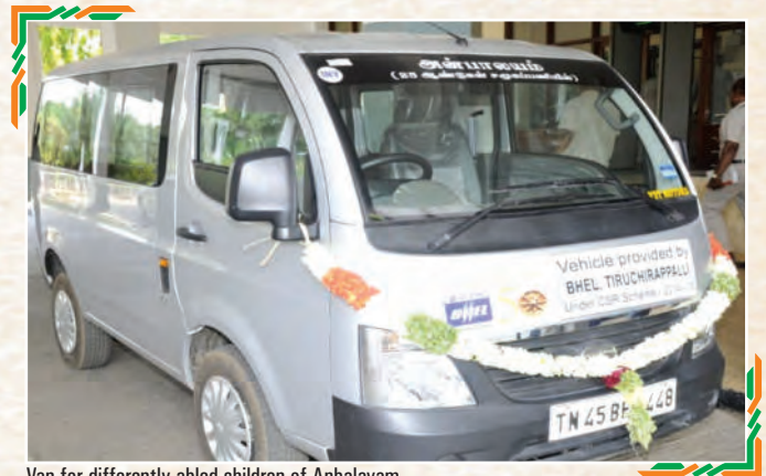
Van for differently-abled children of Anbalayam

Anbalyam is a home for wandering mentally ill, run by Anbalayam Trust. Now, Anbalayam is home for 120 such persons. The agency picks up the mentally ill from the streets and provides medical treatment, food shelter, etc. and rehabilitation to them. A few of them have rejoined their families after being cured of their mental illness. The agency also goes around the city and provides food