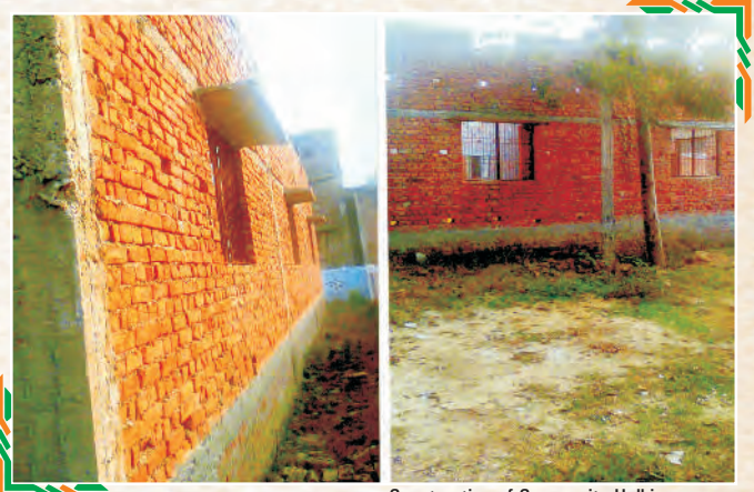
Construction of Community Hall in progress

cerebral palsy, birth and other disabilities. The unit provided support for corrective surgery and rehabilitation including provision of assistive aids and appliances and also providing them with guidance for education and physical rehabilitation. Further, the unit had also funded installation of Solar Street Lighting and water heating systems in the hostel for Girl children. The total cost of the project is Rs. 7.25 Lac.