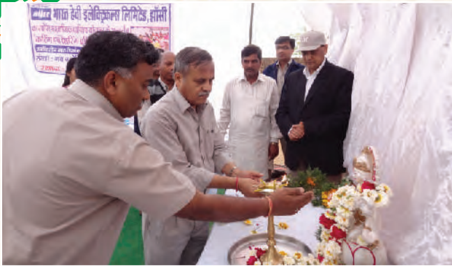
Inauguration of Cutting & Tailoring Program

BHEL-Jhansi has implemented the CSR project "Cutting & Tailoring training for the weaker sections of the society" with the help of an NGO named "Nav Jyoti