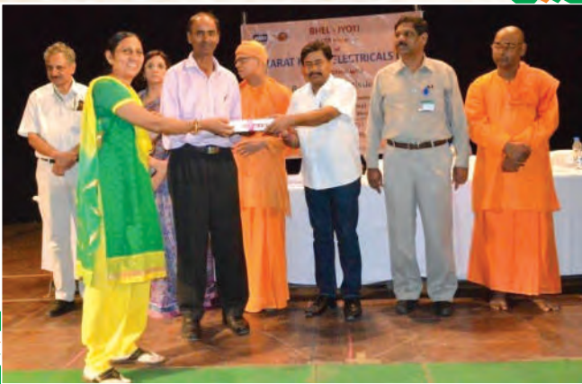
Distribution of projector cum Laptops

TBG-BHEL in association with Ramakrishna Mission, Delhi had undertaken "BHEL-Jyoti CSR project" for distribution of "Projector-cum-Laptop" worth Rs. 40 Lakh to 44 Government Schools each in Bhopal and Delhi.