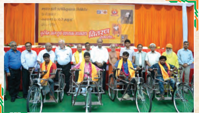
Beneficiaries along-with their tricycles

On April 29, 2015, as part of "BHEL-Kalyanam Karoti CSR Programme", TBG CSR team in association with NGO-Kalyanam Karoti (Mathura) organized an event for free distribution of artificial limbs and medical aid instruments worth Rs. 5.15 Lakh in Kalyan Dham, Mathura.