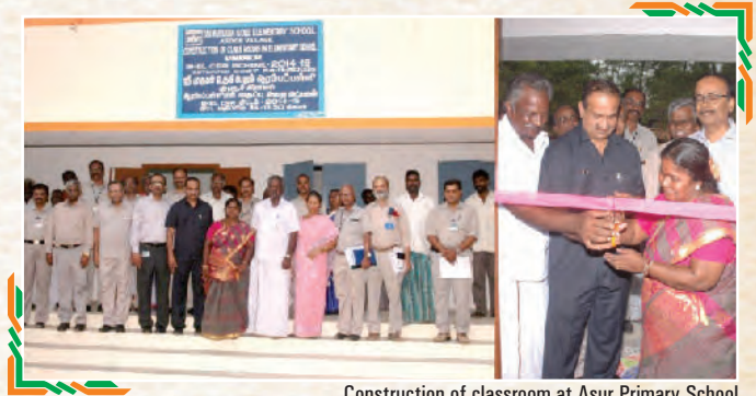
Construction of classroom at Asur Primary School

The BDO of Thiruverumbur and elected president of Thirunedungulam forwarded the request of the Head