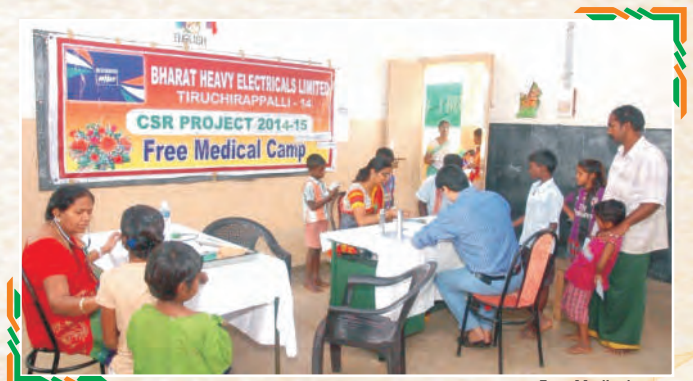
Free Medical camp

Free of cost sanitary napkins were distributed to girls of Govt. /Govt. Aided Schools.