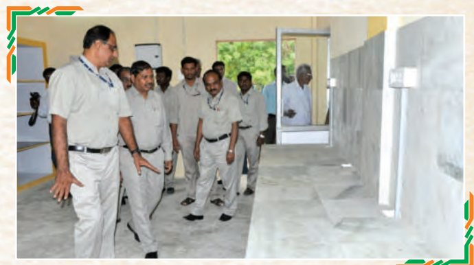
Executive Director inspecting the Computer Lab at Government Higher Secondary School, Kodaikal Village.

Govt. Hr. Sec. School located at Kodaikal Village in Vellore district. This is a state government run Higher Secondary School with a strength of around 850 students