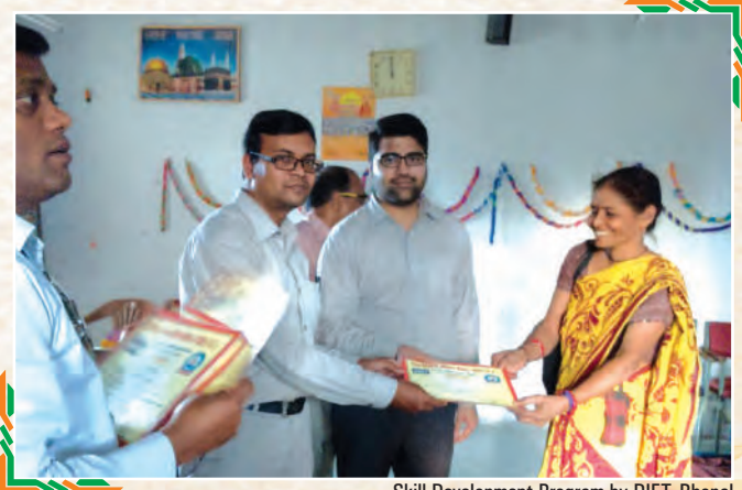
Skill Development Program by DIET, Bhopal

DIET, Bhopal conducted Skill Development program on “Sewing, Macramé & Purse making” for the female slum dwellers from nearby slums. Total number of participants in the program were 73.