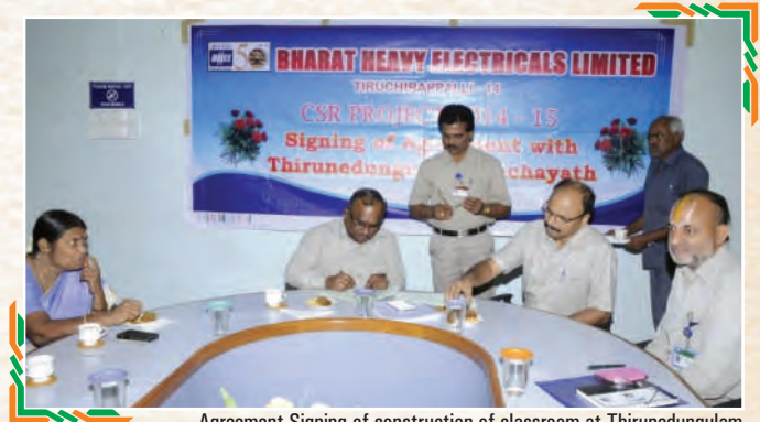
Agreement Signing of construction of classroom at Thirunedungulam

Mistress of the Government Girls Higher Secondary School for building additional class rooms, under the SSS scheme, to meet the need that arose as the school was upgraded to Higher Secondary level. BHEL signed an MoU to this effect with BDO and Rs. 20 Lakh has been given to the District Collector. The balance amount of Rs. 40 Lakh will be provided by the State Government.