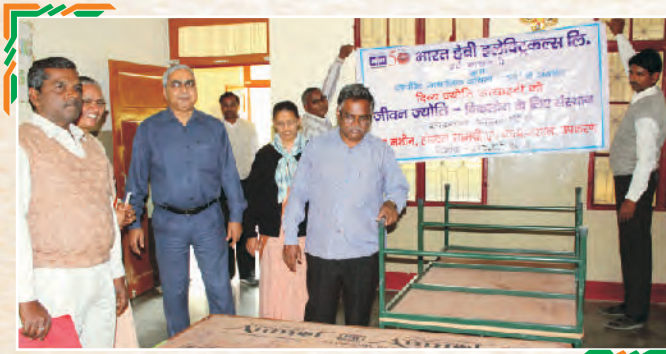
Equipments for Hemophilia Patients

BHEL-HERP, Varanasi has provided Equipment for 'Multi setup expansion of Ashadeep', a psycho-social Hemophilia Care Centre operating under the aegis of