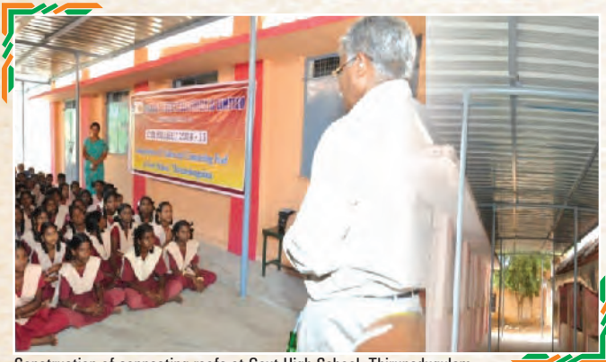
Construction of connecting roofs at Govt High School, Thirunedugulam