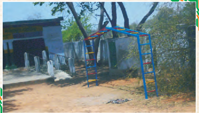
Playground equipments for School children

Kits, Footballs, Skipping ropes, Flying Discs etc. were handed over to the village school children. This is an effort to encourage the students from rural areas for joining school and also for participating in games with the motto "A Healthy Mind Lives In A Healthy Body".