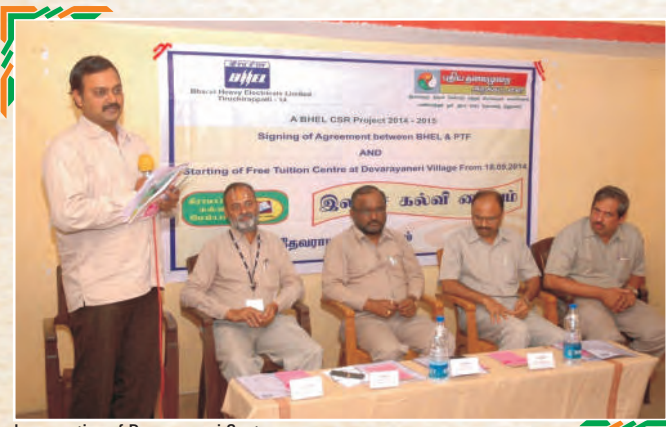
Inauguration of Devarayaneri Centre