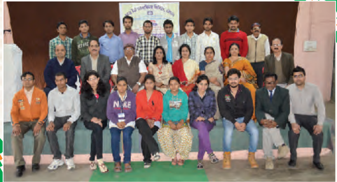
Scholarship Distribution Ceremony for Engineering/MBBS students