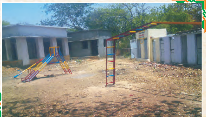
Playground equipments for School children