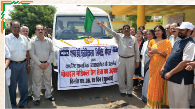
Flagging off of Mobile Medical Van by ED, BHEL, Bhopal

The MMU will operate regularly and every month it will cover 20 villages in the vicinity of BHEL-Bhopal. Free health checkup by qualified medical practitioners/ technicians and appropriate medicines shall be administered besides diagnostic tests like E.C.G., Blood Tests etc. shall also be provided free of cost to the poor/ needy villagers.