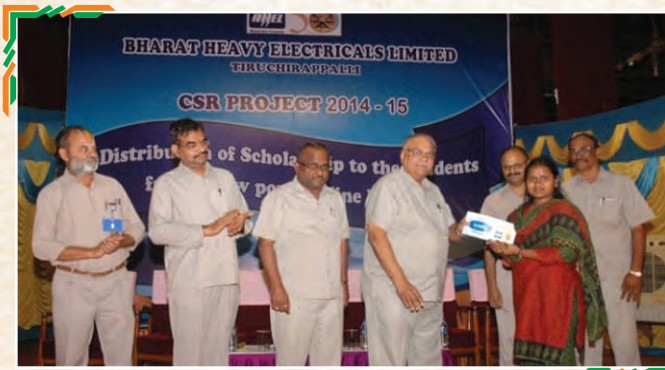
Distribution of Scholarships to students Below Poverty Line