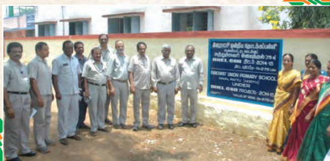
Construction of Compound wall at Navalpattu PU School

Valayuris, a hamlet, is located at Pachamalai Hills, about 80 kms from BHEL, Trichy at an altitude of 1000 meters from sea level. The village is inhabited by tribal