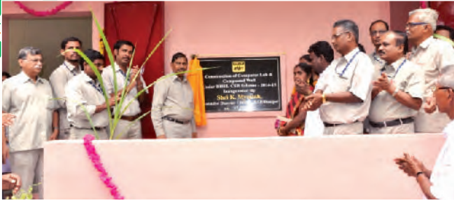
Executive Director inaugurates newly constructed Computer Lab at Government Higher Secondary School, Kodaikal Village.

approx. 2500 girl students from under-privileged sections of the society study. The compound wall was in a damaged/dilapidated condition making the girl