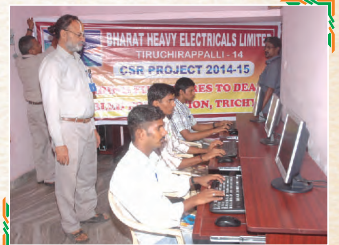
Provision of Furniture and Invertor

project milestone activities and payment schedule. The BDO was the nodal agency for this project. The Well was dug out and a pump set installed for pumping water to the adopted villages. The total Cost of the Project is Rs. 12.69 Lakh.