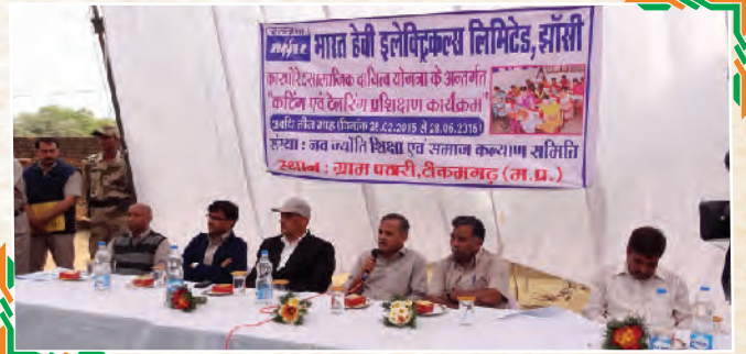
Inauguration of Cutting & Tailoring Program

providing them with financial assistance and books etc. The organization is also associated with activities like, organizing medical camps, providing drinking water facilities for the socially and economically backward communities, helping in environment protection by organizing environment awareness programmes, tree plantation, etc.