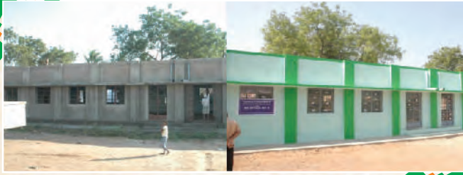
Before & After : Renovation of Devarayaneri