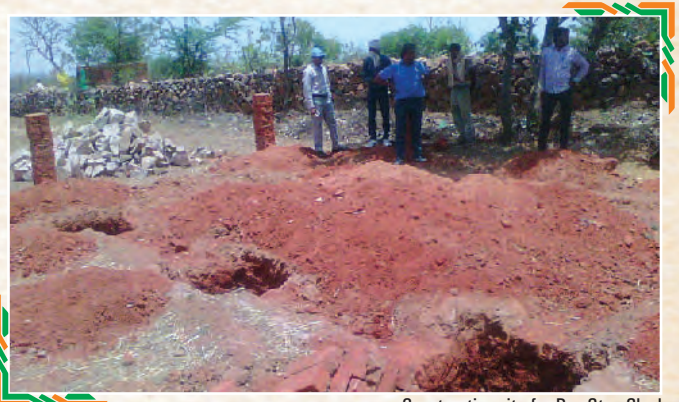
Construction site for Bus Stop Shed

Implementation of the Corporate Social Responsibility Project “Providing Bus Stop at nearby villages Junctions” near pathari (On the way from Chakarpur to Orchha)