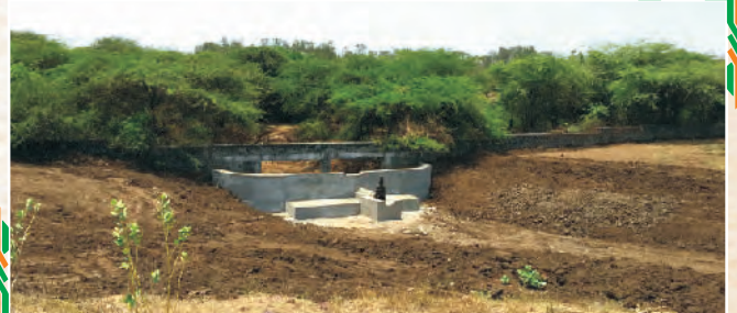
Stop Dam Constructed for Rain Water Harvesting

BHEL, Bhopal under its Corporate Social Responsibility Program constructed stop dam for rain water harvesting near Golf Course in Sports Complex which is used mostly by outsiders.