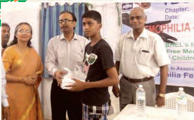
Distribution of Anti Hemophilic Factor (AHF) medicines to Hemophilia affected children by Director(HR)

BHEL-TBG, in association with Hemophilia Federation (India), is undertaking a Pan India CSR project called "Heal A Soul 2" to provide free of cost Anti-Hemophilic Factors (AHFs) to 720 poor children suffering from Hemophilia and Prevention of Hemophilia - support for Carrier Detection (CD) and Prenatal Diagnosis (PND) of 120 women from Hemophilic background. This corporate-aligned CSR project of BHEL would cost Rs. 3.2 Crore and would be implemented during 2014-15, 2015-16 and 2016-17.