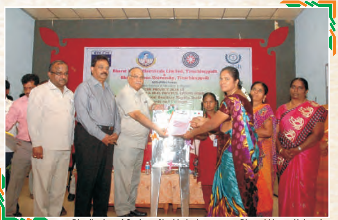
Distribution of Sanitary Napkin Incinerators to Bharathidasan University

An agreement was signed between BHEL and Bharathidasan University to provide 170 SNIs in a period of three years at a total cost of Rs. 57.18 Lakh. Through tendering process of Bharathidasan University incinerators were purchased and were issued to beneficiaries in the presence of Executive Director of BHEL and Vice Chancellor of Bharathidasan University. Girl students of fifteen Colleges and 45 Schools were the beneficiaries. In 2012-13 also, 25 such SNIs were provided to schools and colleges.