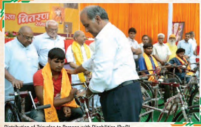
Distribution of Tricycles to Persons with Disabilities (PwD)