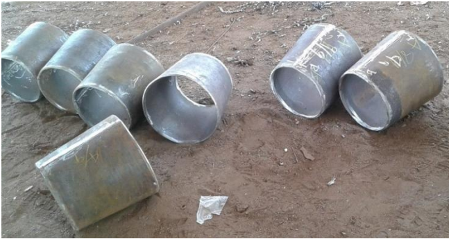
PLATE FORMED REDUCERS