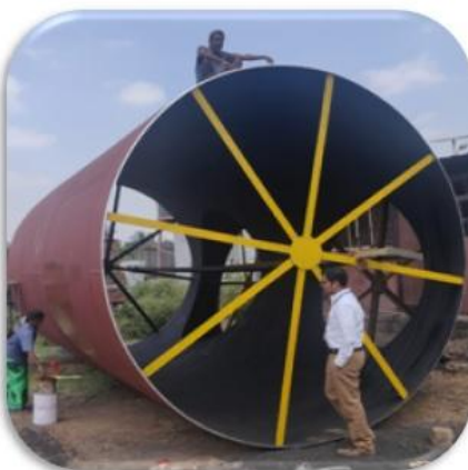
PLATE FORMED PIPE WITH BRANCH & STIFFNER