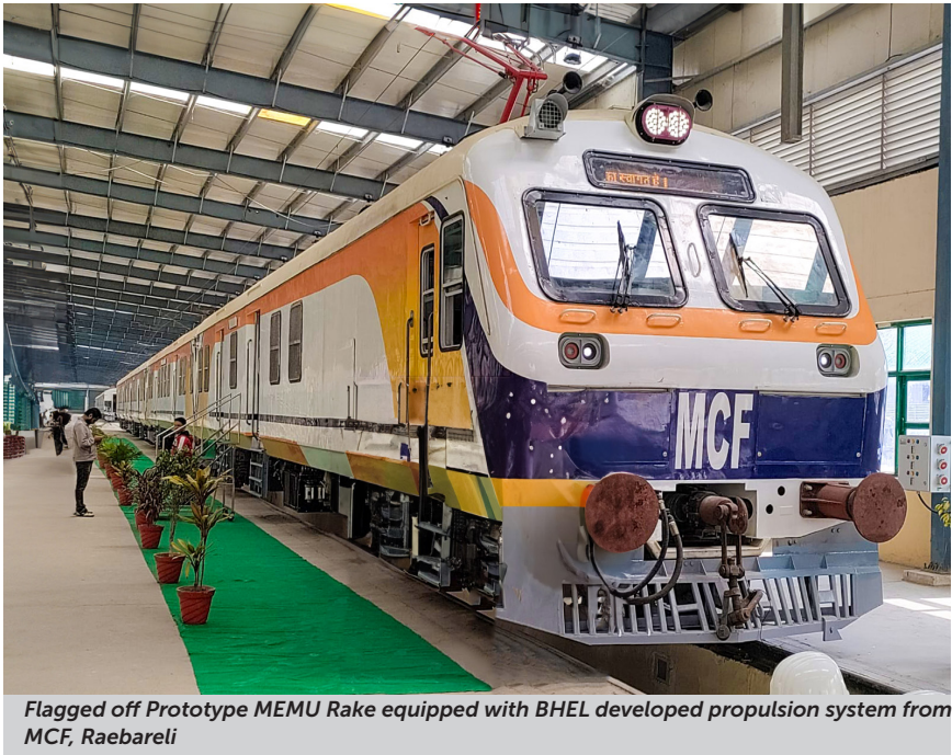
Flagged off Prototype MEMU Rake equipped with BHEL developed propulsion system from MCF, Raebareli