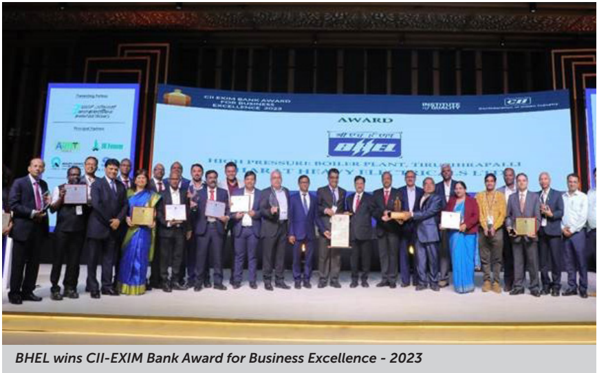
BHEL wins CII-EXIM Bank Award for Business Excellence - 2023

We remain committed to quality and sustainability . Our Business Excellence journey has seen remarkable success, with ten units participating in the prestigious CII EXIM Bank Award 2023 . We're also making significant strides in our environmental initiatives, aiming for net-zero emissions by 2047 through our "Harit BHEL" initiative.