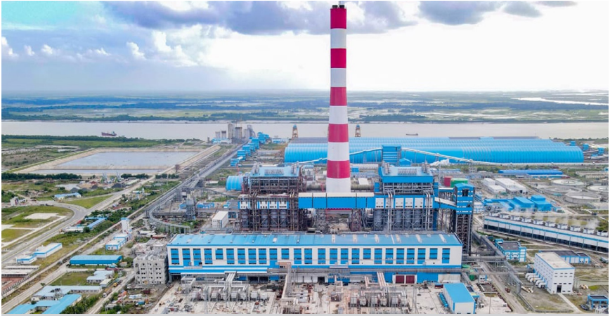
2x660 MW Maitree Super Thermal Power Plant in Bangladesh

Looking ahead, we're focusing on several strategic initiatives to drive growth and innovation: