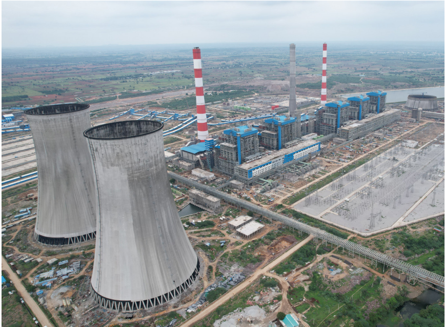
5x800 MW Yadadri Thermal Power Station in Telangana

The Indian economy continues to show robust growth , driven by domestic demand, consistent policy measures , and infrastructure development. These factors have created numerous business opportunities, which BHEL is capitalising on .