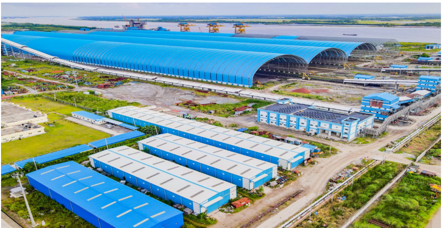
Coal shed at 2x660 MW Maitree Super Thermal Power Plant in Bangladesh